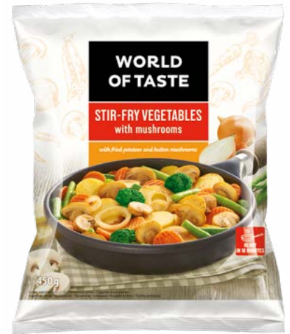
Stir-fry vegetables with mushrooms 450 g

Ingredients: broccoli, carrot, onion, green cut bean, corn, green bell pepper, red bell pepper, courgette, pre-fries onion slices.