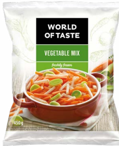
Vegetable mix 450 g

Ingredients: carrot, broccoli, cauliflower.