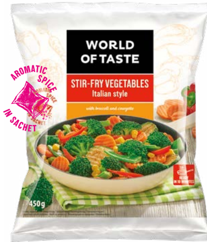
Stir-fry vegetables Italian style with broccoli and courgette 450 g

Ingredients: broccoli, carrot, green flat bean, corn, red bell pepper, courgette, herb spice.