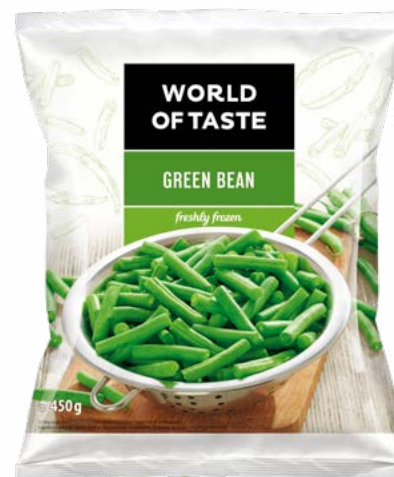
Green bean 450 g