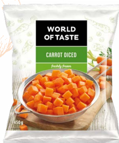
Carrot diced 450 g