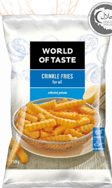
Crinkle fries for deep-frying 750 g