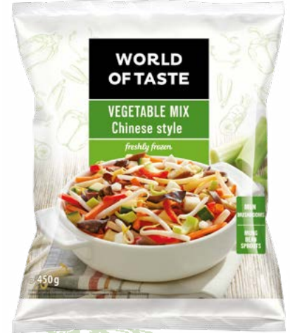
Vegetable mix Chinese style 450 g

Ingredients: carrot, Mung bean sprouts, Mun mushroom, bamboo shoots, courgette, red bell pepper, leek, onion.