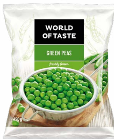
Green peas 450 g