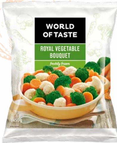
Royal vegetable bouquet 450 g

Ingredients: carrot, Mung bean sprouts, Mun mushroom, bamboo shoots, courgette, red bell pepper, leek, onion.