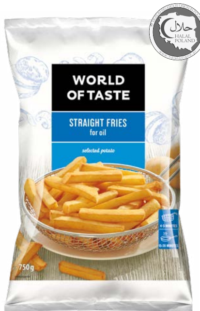
Straight fries for deep-frying 750 g, 1 kg