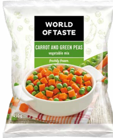
Carrot and green peas vegetable mix 450 g

Ingredients: carrot, cauliflower, green cut bean, green peas, leek, celery, parsley.