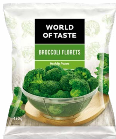
Broccoli florets 450 g