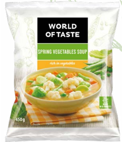
Spring vegetables soup 450 g

Ingredients: carrot, parsley, celery, leek.