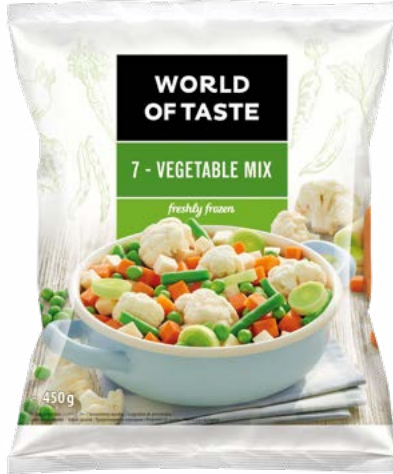
7-vegetable mix 450 g

Ingredients: carrot, cauliflower, green cut bean, green peas, leek, celery, parsley.