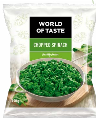
Chopped spinach 450 g