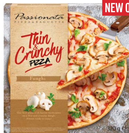
Pizza Funghi 320 g