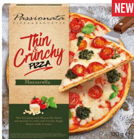
Pizza Mozzarella 320 g